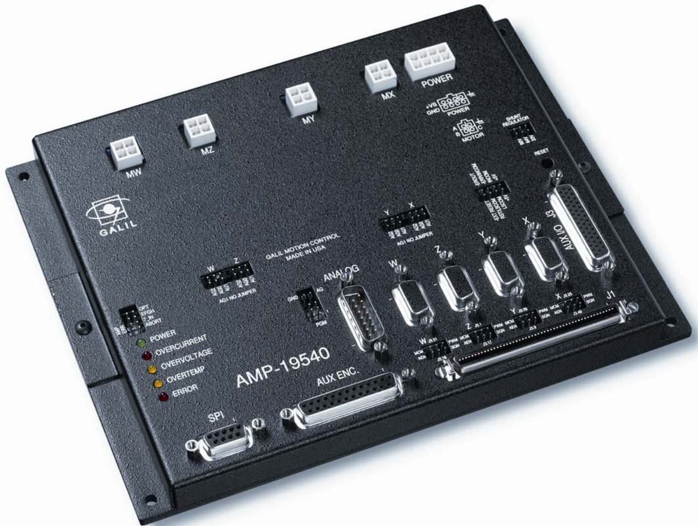
Figure 1. AMP-19540