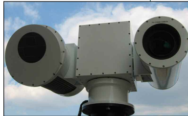
Night Hawk system provides 360 degree surveillance to guard against enemy attacks.

"We've delivered over 100 of these systems to date and there have been no reported failures with the Galil controller," added Miller. "They are performing in a full military environment in very rugged, extreme conditions.